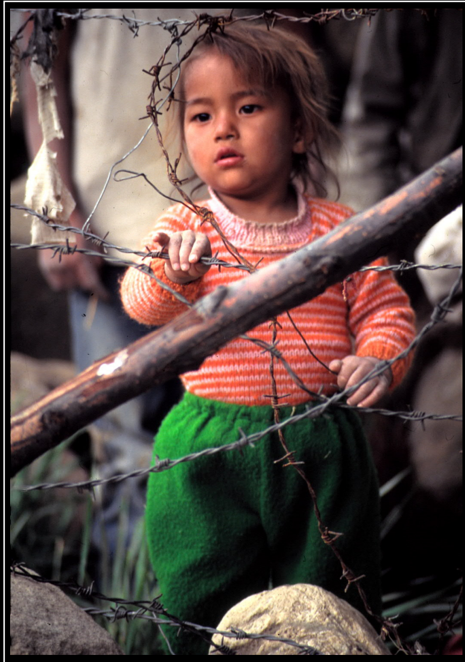
☺ Glide unharmed through all obstacles constricting you. ☺ Curious child behind a barbed wire fence in Leh, the capital of Ladakh – August 1995